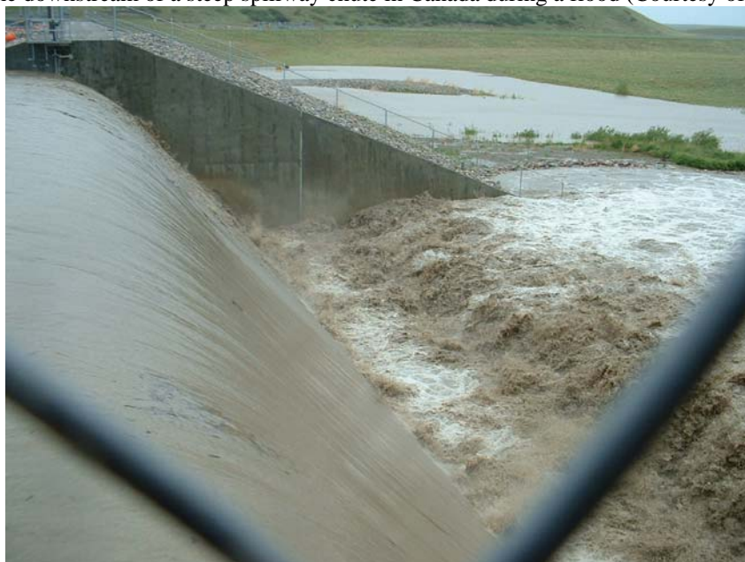
Hydraulic jump at the downstream of a steep spillway chute in Canada during a flood

Solution : the flow conditions correspond to a steady hydraulic jump. See textbook pp. 60 & 412-417. Numerical solution: Fr_1 = 8.7 , d_1 = 0.18 m, \Delta H = 4.76 m