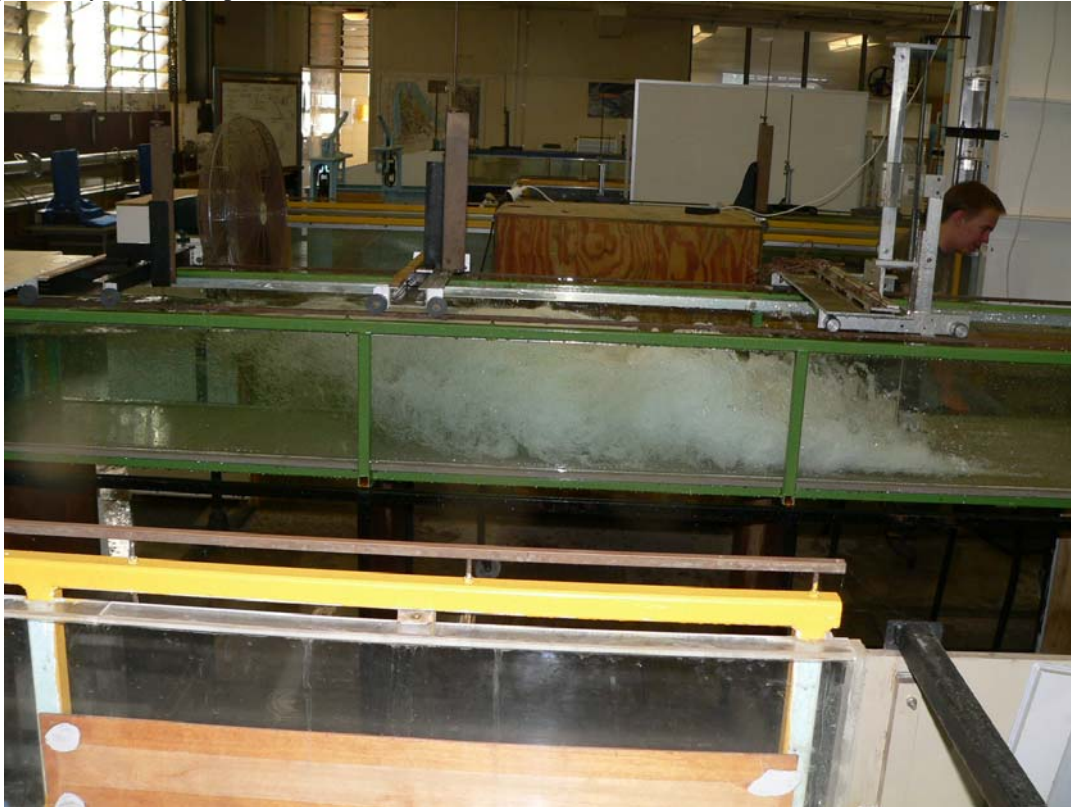
Photograph of a hydraulic jump ( Fr_1 = 11 )