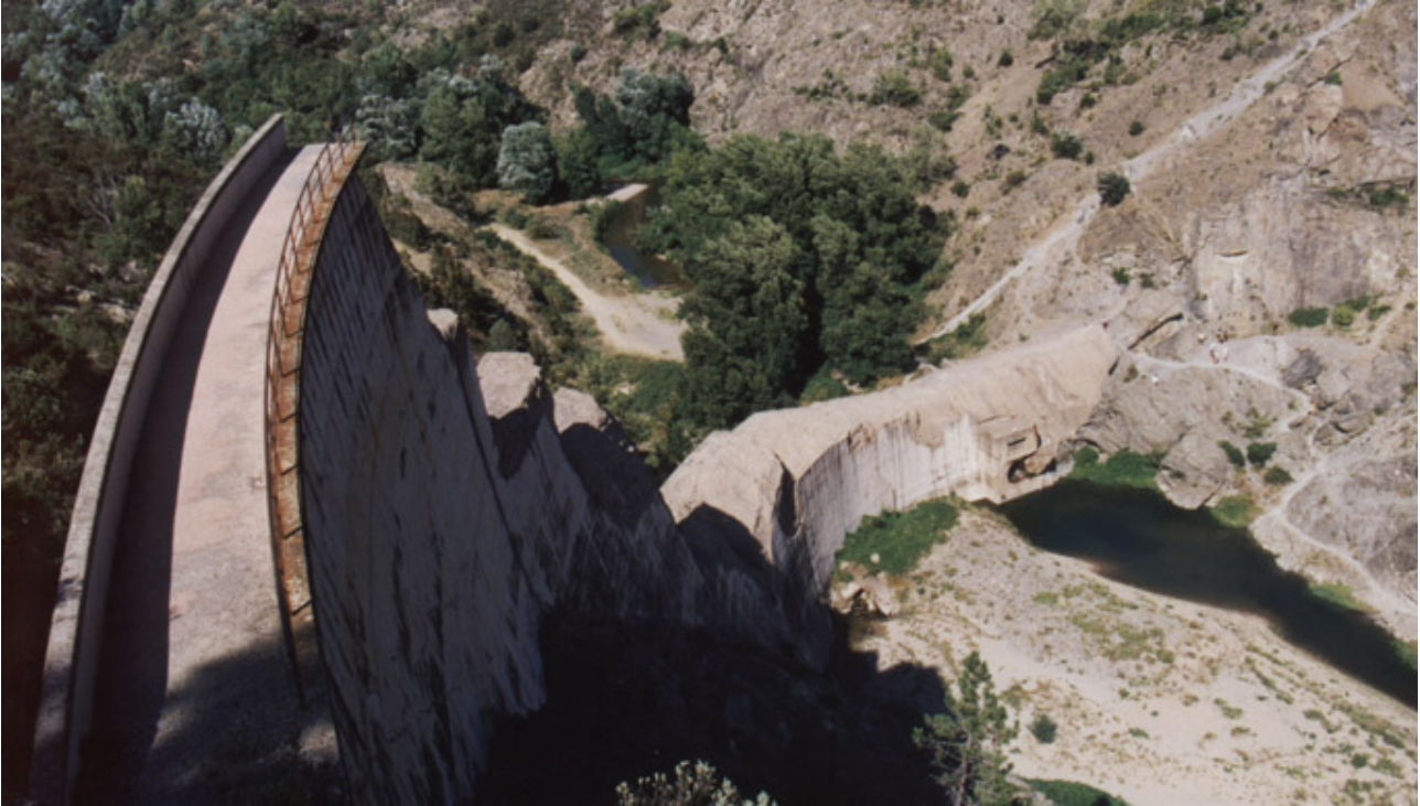
(B) Details of the left abutment