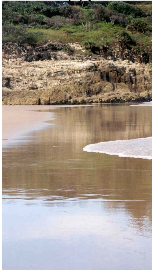
Fig. - Breaking wave runup on a beach face - Front propagation from left to right