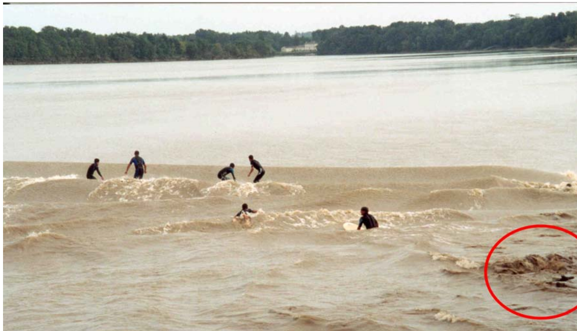
Fig. 2 - Advection of bed material to the surface (bottom right of photograph) immediately downstream of an undular tidal bore - Dordogne river (Fra.), 27 Sept. 2000 around 5:00 pm - Looking from behind the advancing bore front

The effect on sediment transport was studied at Petitcodiac and Shubenacadie rivers (Can.), in the Sée and Sélune rivers (Fra.), Ord river (Aus.), Turnagain Arm inlet (Alaska) and on the Hangzhou bay (Chin.) (e.g. TESSIER and TERWINDT 1994, BARTSCH-WINKLER et al. 1985, WOLANSKI et al. 2001, CHEN et al. 1990). The arrival of the bore front is associated with intense bed shear and scour. Behind sediment material is advected upwards by large scale turbulent structures evidenced in Figure 2. Sediment suspension behind the bore is sustained by strong long-lasting wave motion. At the Dee river (UK), Dr E. JONES observed more than 230 waves, also called whelps or éteules . MURPHY's (1983) photograph showed more than 30 well-formed undulations behind the Amazon pororoca . At the Dordogne river (Fra.), the writer observed an intense wave motion lasting more than 20 minutes after the bore passage (CHANSON 2001).